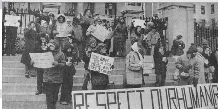
Clients and staff members of Easthampton's Riverside Industries Inc. and the Northampton-based Center for Human Resources Development join others at the Statehouse yesterday to protest possible funding cuts.